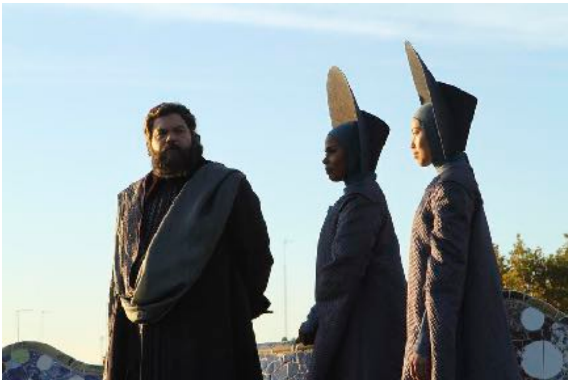
Vincent D'onofrio as The Wizard, Roxy Sternberg as Elizabeth, Susan-Li Ong as Isabel, Emerald City

obstacles than Dorothy could've ever imagined. Way back in 2014, NBC was ready to put 10 episodes of the series on air in 2015. But after a dispute with its leaders Matthew Arnold ( Siberia ) and Josh Freidman ( Terminator: The Sarah Connor Chronicles ) things fell apart and the entire project was scrapped before it even went into production. NBC brought it back in 2015 though, bringing on a new team including executive producer Shaun Cassidy , showrunner David Schulner ( Desperate Housewives ) and Tarsem Singh ( The Cell , The Fall ) as director. Singh mandated he shoot all the episodes (as opposed to being split among multiple directors as most shows are) like a 10-hour movie and that all 10 episode scripts be done in advance. Even after that, scripts were re-written as actors and locations were chosen. With so much invested, there may be many fingers crossed at NBC in hopes that this supernatural story could perhaps be its next Grimm , which is concluding this season.