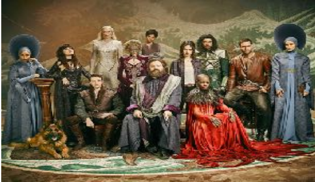
L-R: Roxy Sternberg as Elizabeth, Ana Ularu as West, Gerran Howell as Jack, Joely Richardson as Glinda/North, Stefanie Martini as Lady Ev, Jordan Loughran as Tip, Vincent D'Onofrio as Wizard/Frank, Adria Arjona as Dorothy Gale, Florence Kasumba as Wicked Witch/East, Mido Himada as Eamonn, Oliver Jackson-Cohen as Lucas, Isabel Lucas as Anna